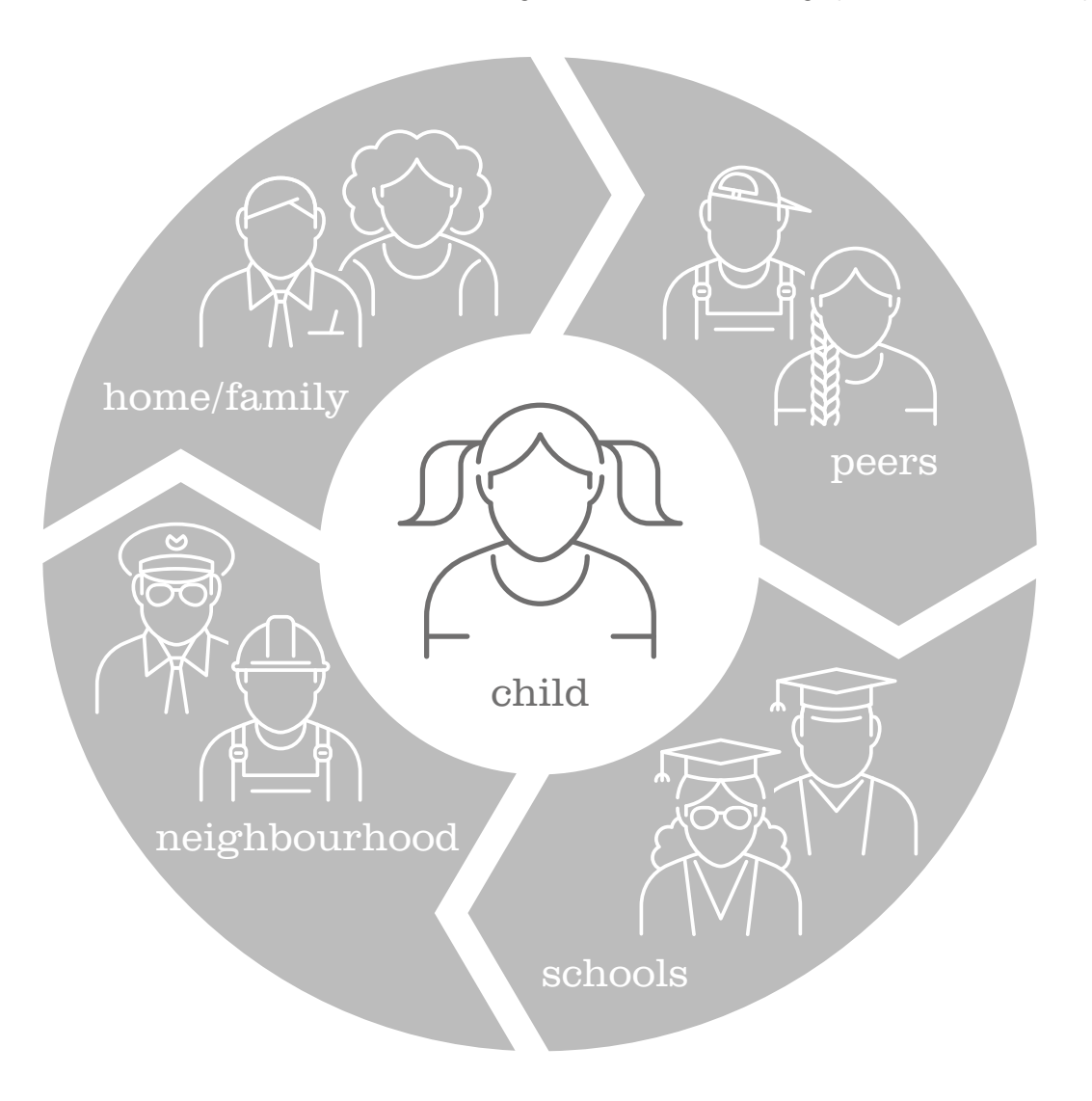
Figure 1: Contexts of Adolescent Safety and Vulnerability (Firmin 2013:47)

Family members often have little influence over extra-familial spaces, so it can be important for practitioners to engage with people who do have more influence within these contexts, e.g. school staff, local businesses.